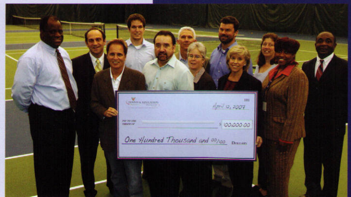
1. Thai Tennis Organization in America 2. Representatives of all four programs met in Philadelphia in Spring, 2007 to discuss plans for their respective projects.